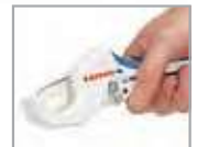
Easy Open & Close