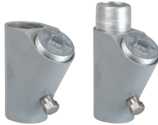
EYD-3 EYD-3-T with Nipple (Drain/Seal for vertical conduit)

EY & EYD Series Class I, Div. 1 & 2, Groups C,D Class I, Zone 1, Groups IIB, IIA Class II, Div. 1 & 2, Groups E,F,G Class III