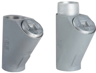
EY-3 EY-3-T with Nipple (For Vertical Conduit)