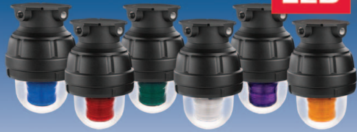
(Shown with ceiling mount. See how to order for mounting options)