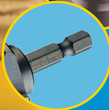
Quick change hex shank