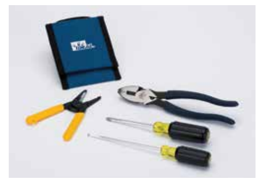
5-Piece Set 35-5792