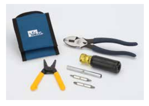
4-Piece Set 35-5799

See website or catalog for complete kit descriptions.