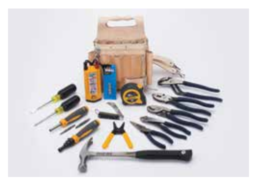
16-Piece Set 35-800