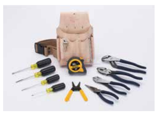
12-Piece Set 35-5805