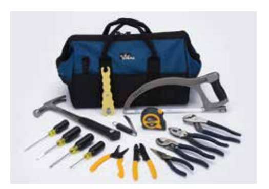
16-Piece Set 35-808