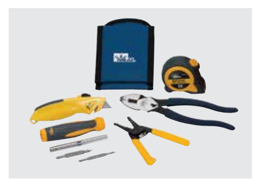
6-Piece Set 35-794