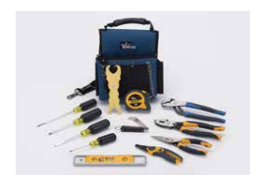
13-Piece Set 35-790