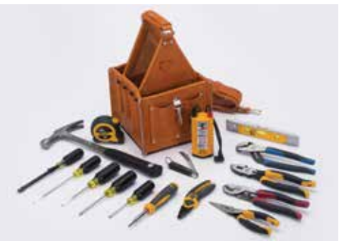
17-Piece Set 35-809