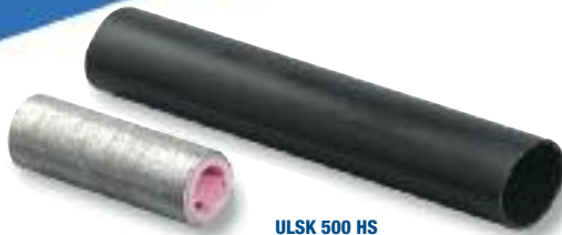
ULSK 500 HS