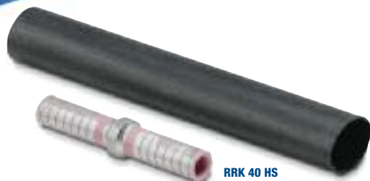
RRK 40 HS