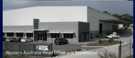
Western Australia Head Office and Warehouse