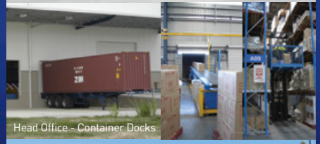
Head Office - Container Docks