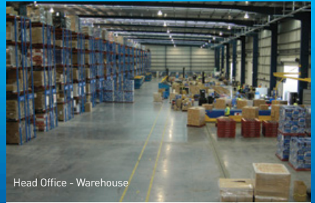
Head Office - Warehouse

With over 140 employees Australia wide, Kincrome has sales offices and warehouses in Victoria, Queensland and Western Australia.