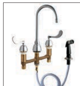
200 Series with side spray