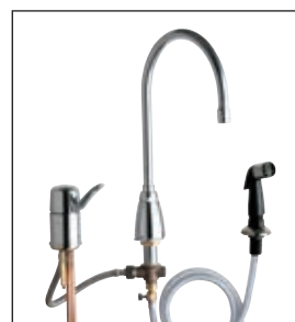
2304 Series with side spray