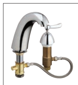
405 Series cold water only