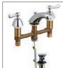
404 Series with pop-up