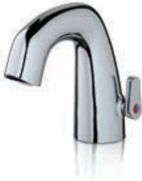
With 4-inch Cover Plate

Our curved spout design with convenient, user adjustable temperature control.