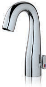
With 4-inch Cover Plate