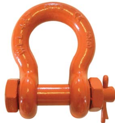
Bolt & Nut