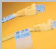
Voice & Data Communications