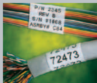
Wire & Cable Labeling