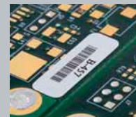
Circuit Board Materials