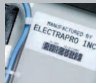
Industrial Barcode Labels