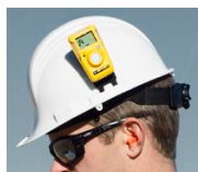
Hard Hat Clip