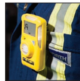
Easy To Wear