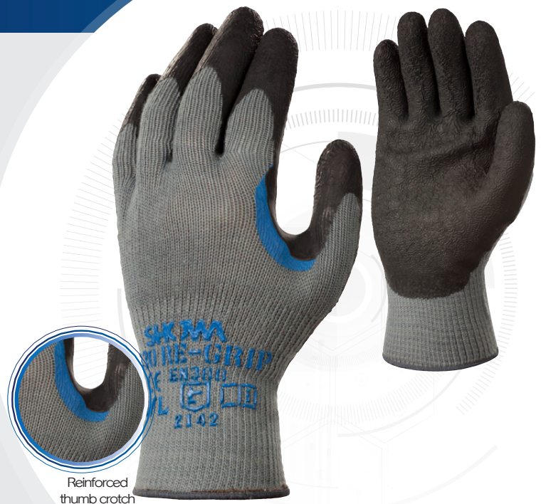
Reinforced thumb crotch