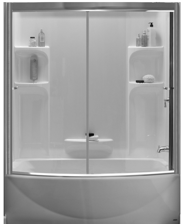
Ovation tub with Ovation wall set and Ovation curved bath door shown.

For color/finish availability and other faucet choices, please see the Product Selector and Pricing Guide.