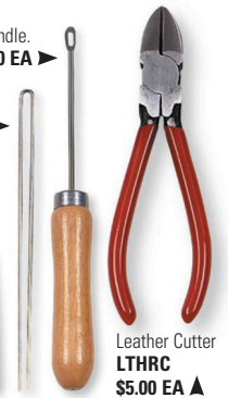
Leather Cutter LTHRC $5.00 EA