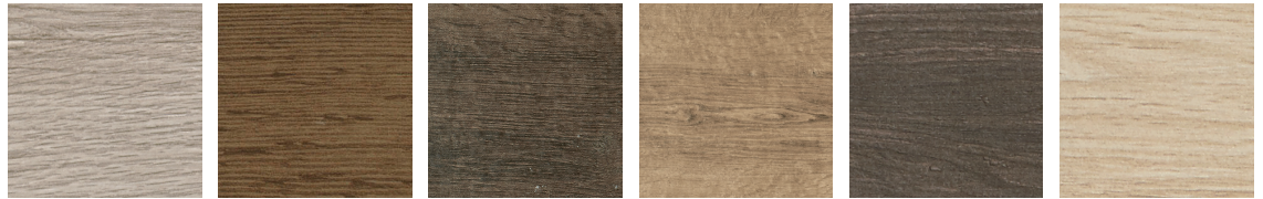
PERSPECTIVE GREY RV70