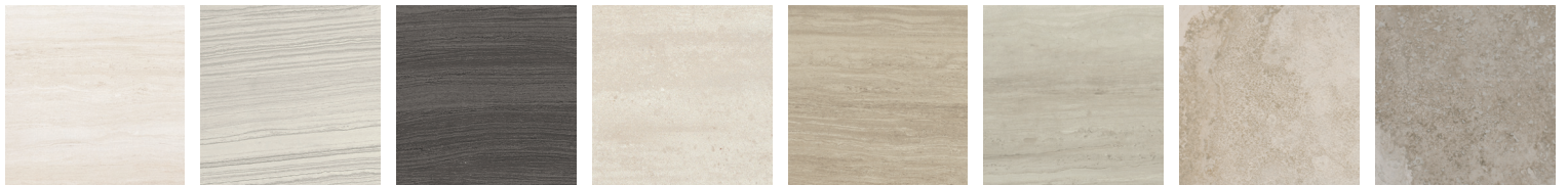
CLIFF STONE QC02