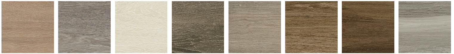
TOASTED PECAN RV76