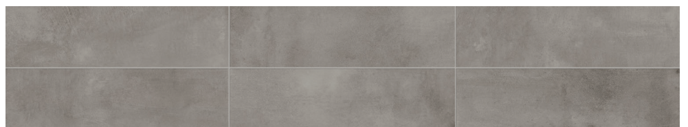
POWER GREY RV90