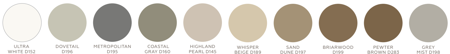
ULTRA WHITE D152