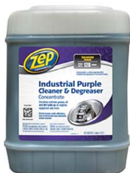
Industrial Purple Cleaner & Degreaser Concentrate - 5 gals ZU08565G