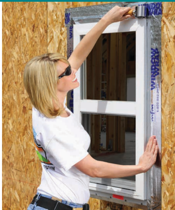
The WindowWrap® family of products are self-adhering, self-sealing waterproofing tapes designed for use around windows, doors, building seams and in general construction.