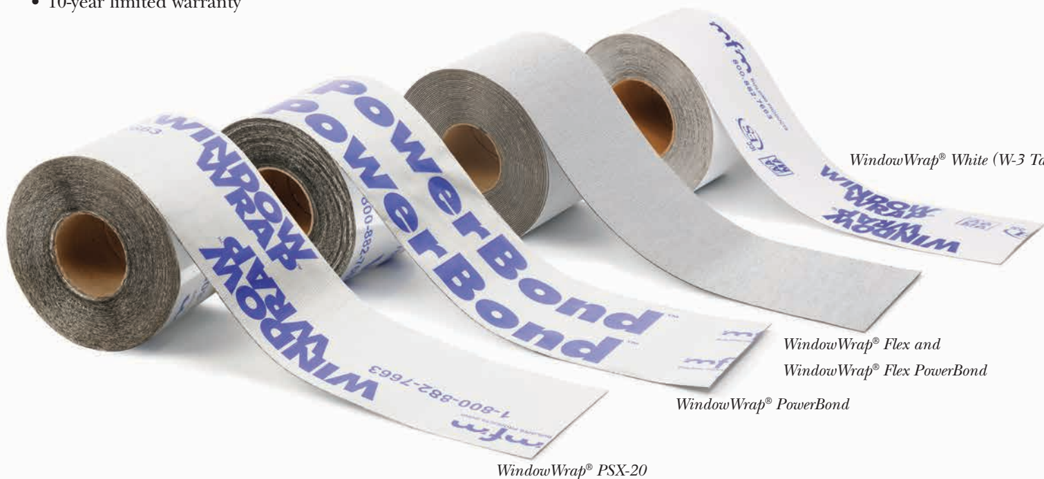
WindowWrap® White (W-3 Tape)

WindowWrap® products are suitable for new construction or home renovation projects. These professional grade products are proven performers and reduce expensive call backs.