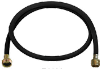
F X M