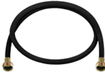
F X F