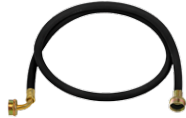
F X 90

Highest quality black EPDM rubber washing machine inlet hose assemblies manufactured to original equipment specifications. Can use for hot or cold lines. Quality plated GHT fittings installed each end. Choose from Female x Female, Female x Male or Female x 90° Female assembly.