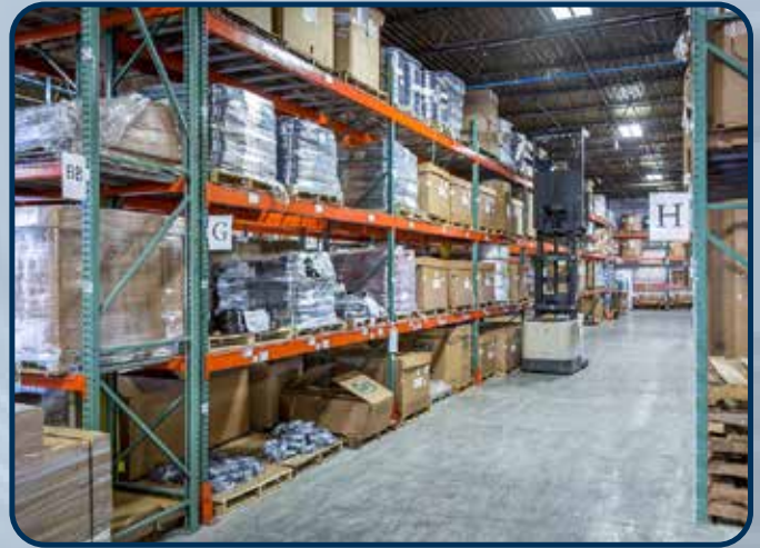
Inventory on-hand to service our customer needs. Large stocks for immediate shipment.