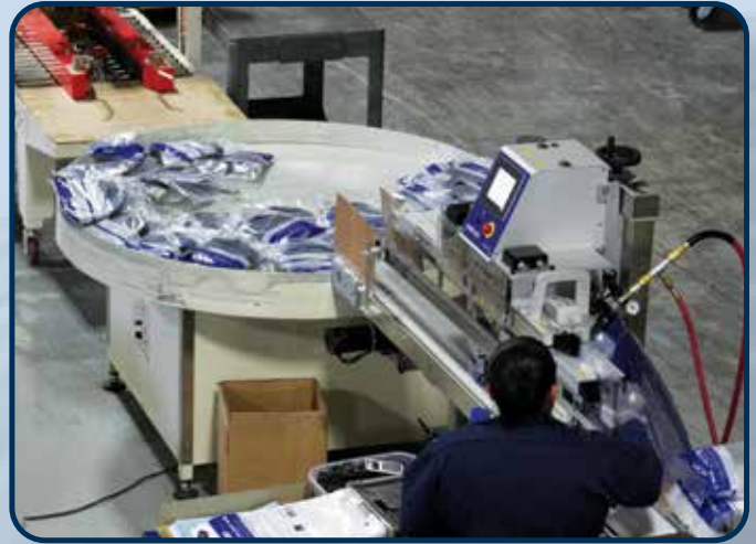
Complete packaging services available. Bagging, tagging and bar coding are just a few of the value added services we offer.