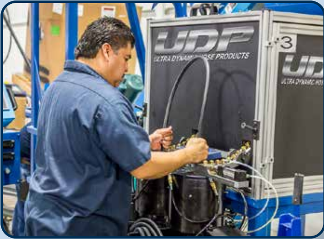
Hose assemblies fabricated to customer requirements - our specialty. Let us know what your requirements are.