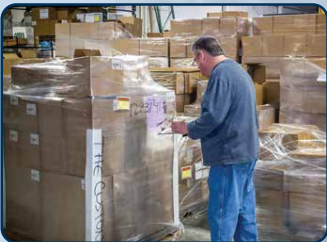
Inspection and quality is paramount with unparalleled customer service.