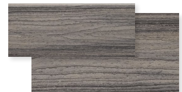
8" or 12" Widths