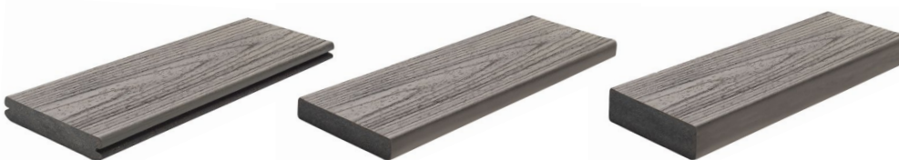
1" Grooved edge