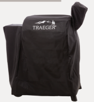
FULL-LENGTH GRILL COVER 20 SERIES SKU: BAC374 22 SERIES SKU: BAC379 34 SERIES SKU: BAC380