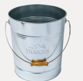
NEW TRAEGER 20LB PELLET METAL STORAGE BUCKET SKU: BAC430