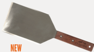
NEW LARGE CUT MEAT & FISH SPATULA SKU: BAC417