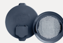
PELLET STORAGE LID & FILTER KIT SKU: BAC370