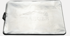
NEW DRIP TRAY LINER 5 PACK 20 SERIES SKU: BAC408 22/850 SERIES SKU: BAC409 34/1300 SERIES SKU: BAC410