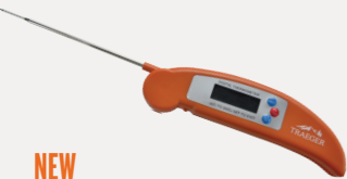
NEW DIGITAL INSTANT READ THERMOMETER SKU: BAC414