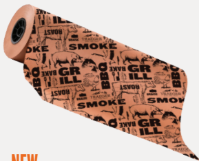
NEW TRAEGER X OREN PINK BUTCHER PAPER 18"X 150' SKU: BAC427