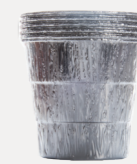
NEW BUCKET LINER 5 PACK SKU: BAC407