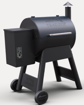
SELECT PRO TFS81PUC (BLUE) / TFS81PZC (BRONZE)

SPECS: 572 sq in grilling area 18 lb hopper capacity Height: 49 in Width: 41 in Depth: 27 in Weight: 103 lbs