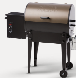
JUNIOR ELITE 20 TFB29LZA (BRONZE)

FEATURES: Digital Elite Controller Compact size for urban living