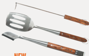
NEW 3-PIECE BBQ TOOL SET SKU: BAC433