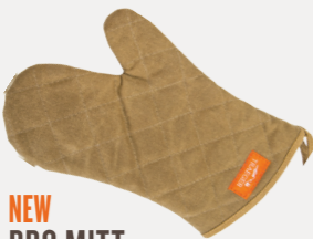
NEW BBQ MITT BROWN CANVAS AND LEATHER SKU: APP195