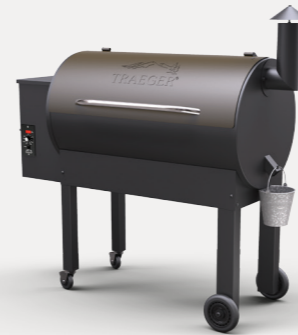
TEXAS ELITE 34 TFB65LZB (BRONZE)

THE ELITE SERIES CONTINUES TO LIVE UP TO ITS NAME with beefier legs and a precise Digital Elite Controller.