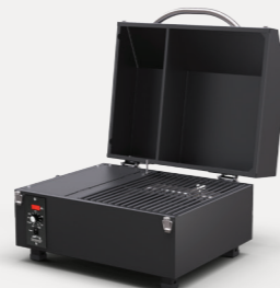
PTG+ TFT17LLA (BLACK)