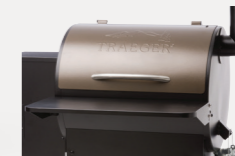
FOLDING FRONT SHELF 20 SERIES SKU: BAC361 22 SERIES SKU: BAC362 34 SERIES SKU: BAC363