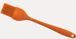
NEW SILICONE BASTING BRUSH SKU: BAC418