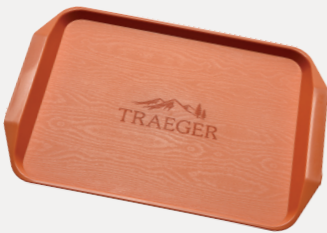
NEW BBQ TRAY 16.7" x 11.5" SKU: BAC426