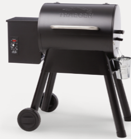
BRONSON 20 TFB29PLB (BLACK)

PERCHED ON THE BALCONY OF YOUR HIGH-RISE or the tallest peak, this portable series is designed to deliver that wood-fired flavor anywhere.