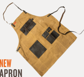
NEW APRON BROWN CANVAS & LEATHER SKU: APP196