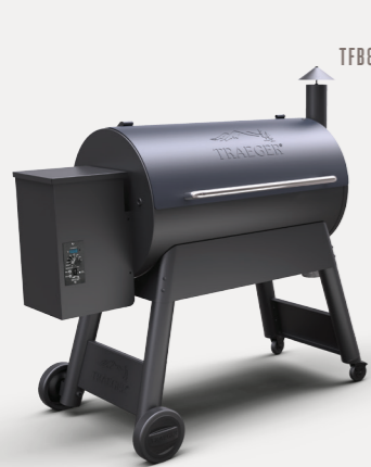
PRO SERIES 34 TFB08PUB (BLUE) / TFB08PZB (BRONZE)

WE'VE REVOLUTIONIZED THE PRO SERIES GRILLS with powerful features that will increase grilling efficiency and convenience for the frequent Traegerist.