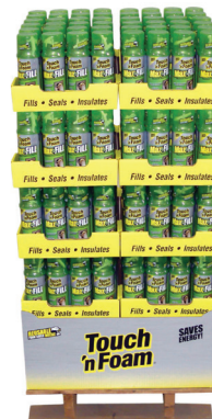
192-unit Mini-Pallet #4001000100