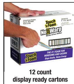
12 count display ready cartons

Eye-catching mini-pallets offer a flexible option for a 192-unit floor display.