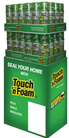
Floor Display holds up to 72 cans #4000725437