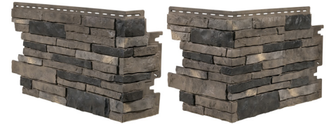
aLL-Pro Corner - available in all colors