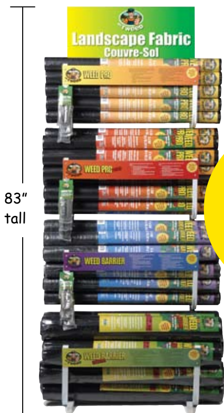
36" Fabric Rolls

Our attractive new freestanding Fabric Displays take less space than two cardboard displays. Now you can now display more than twice as many rolls and drive sales. Book early for guaranteed delivery.