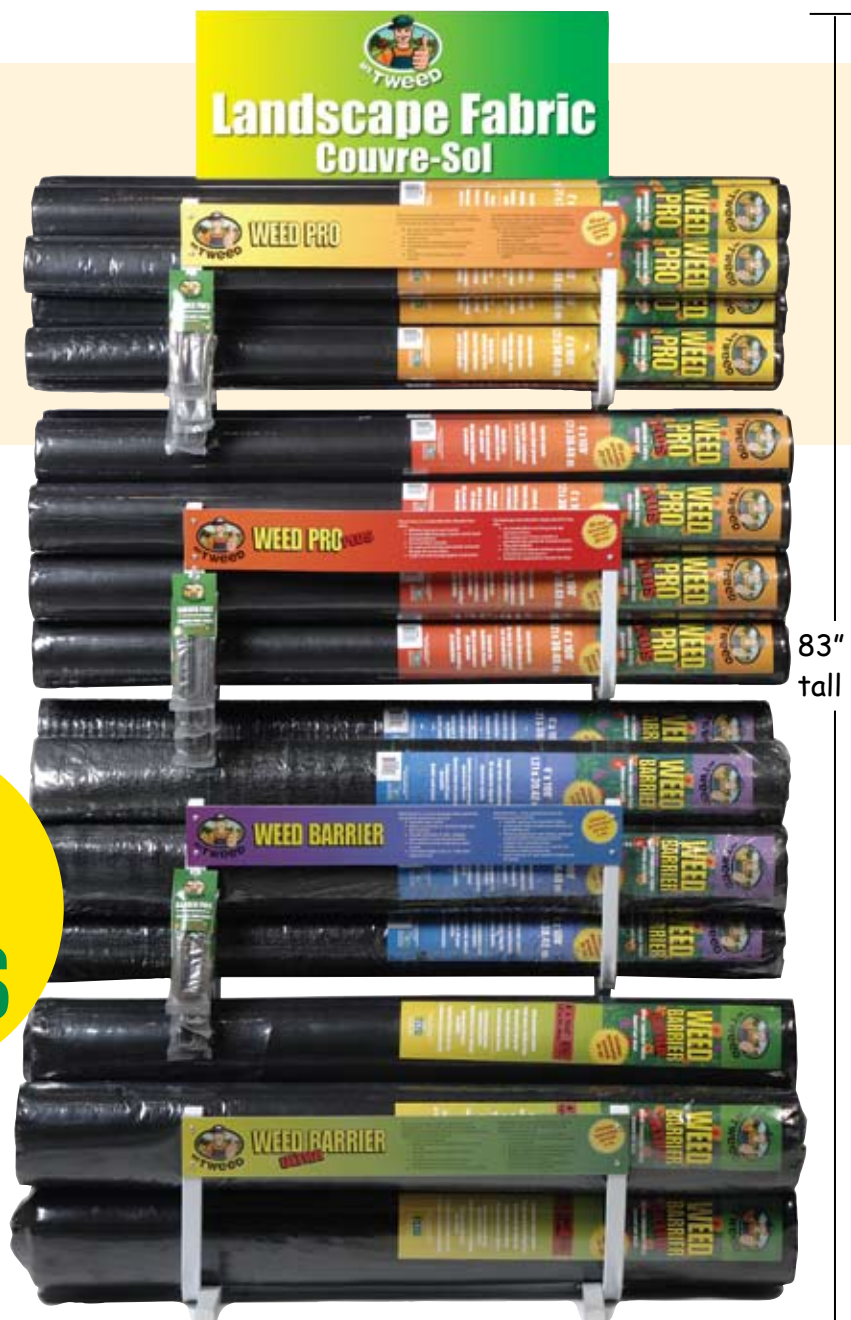
48" Fabric Rolls