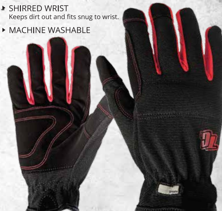
Small 9081 | Medium 9082 | Large 9083 | XLarge 9084 | XXLarge 9086