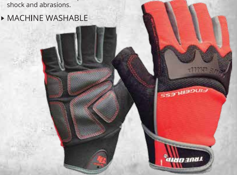
Small 9861 | Medium 9862 | Large 9863 | XLarge 9864