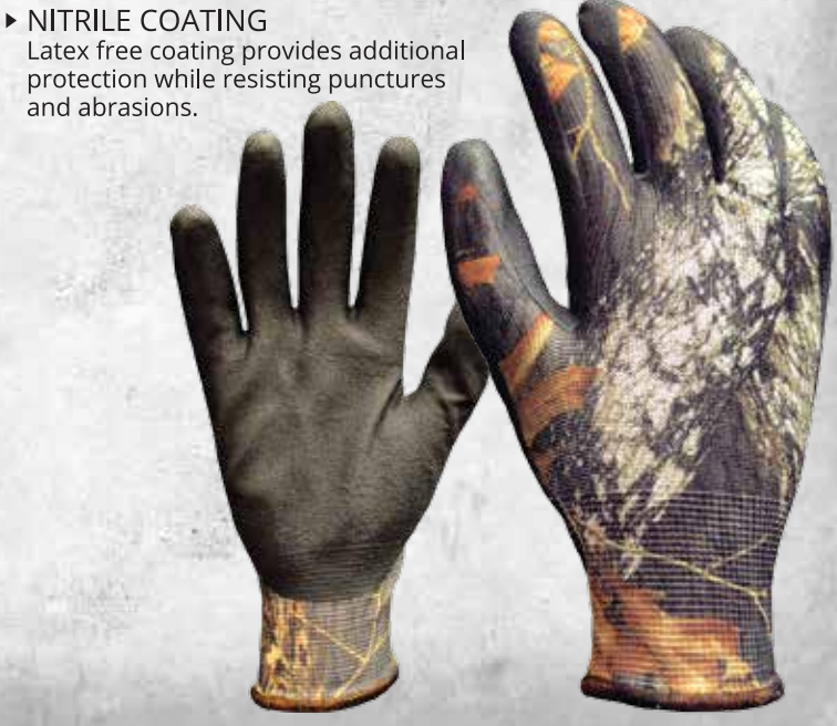
Large 9797 | XLarge 9798

▶ 100% NYLON SHELL Greater durability and elasticity over traditional polyester shells.