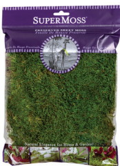
Header Bag (2oz, 4oz, 8oz)