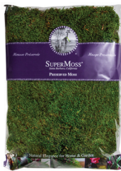
Bag (16oz, 32oz)