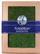
Display Box (4oz, 8oz)