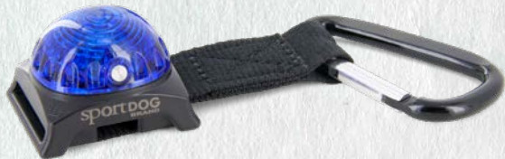
SHOWN WITH INCLUDED CARABINER ATTACHED