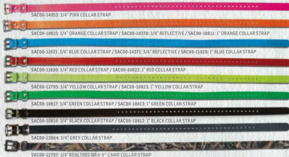
SAC00-14053: 3/4" PINK COLLAR STRAP