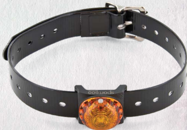
SHOWN ON 1" COLLAR STRAP