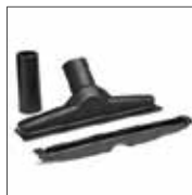
91966 - 10" Squeegee Nozzle For wet pick up.