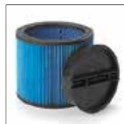
90350 (TYPE X) Large Ultra Web® Cartridge Filter Fits Shop-Vac® brand wet/dry vacs 5 U.S. gallon and above except 5 U.S. gallon portable model H87S, 6 U.S. gallon long life model P12S and HangUp® Wall Mount vacs.