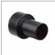
90649 - 2 1/2" to 1 1/2" Converter Allows you to use 2 1/2" accessories with a 1 1/2" hose.