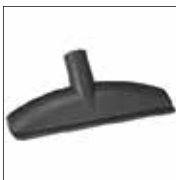
90621 - 10" Wet/Dry Nozzle Good for all purpose cleaning.