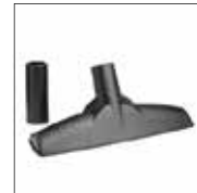
91991 - 12" Floor Nozzle Cleans wide areas for wet or dry pick up.