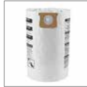
90663 (TYPE G) Filter Bags (3 pack) Fits 15-22 U.S. Gallon vacs.