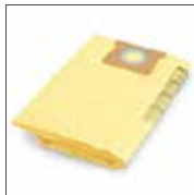
90673 (TYPE J) High Efficiency Filter Bags (2 pack) Fits 15-22 U.S. Gallon vacs.