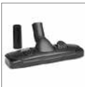
91968 - Dual Surface Nozzle For use with both carpets and floors.