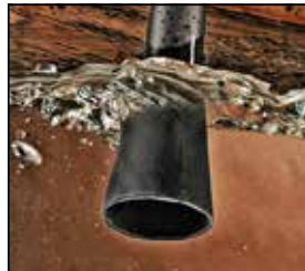
PICK IT UP