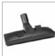
90632 - Multi Purpose Floor Nozzle Economical nozzle with settings for both carpet and bare floors.