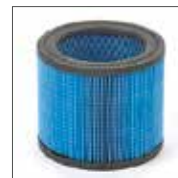
90397 (TYPE BB) Small HangUp® Ultra Web® Cartridge Filter Fits 1-4 U.S. gallon vacs, 5 U.S. gallon portable model H87S, 5 U.S. gallon HangUp®/ Wall Mount vacs and 6 U.S. gallon long life model P12S. Does not fit 1x1", Micro®, HangOn® and HangUp® Mini.