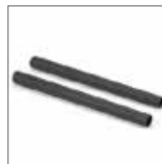
91995 - 2 - Piece Extension Wands Provides longer reach when cleaning.