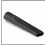
90616 - Crevice Tool Gets hard-to-reach places. Cleans radiators, vehicle interiors, etc.