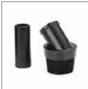
91997 - Round Brush Great for all purpose dry pick up; dirt, sawdust, furniture venetian blinds, etc.