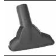
90619 - Gulper Nozzle Fast pick up tool. Ideal for vehicle interiors.