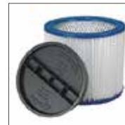
90340 (TYPE W) Large CleanStream® HEPA Cartridge Filter 99.97% efficient down to 0.3 microns. Non-stick surface makes for easy clean up and resists clogging. Fits Shop-Vac® brand wet/dry vacs 5 U.S. gallon and above, except 5 U.S. gallon portable model H87S, 6 U.S. gallon long life model P12S and HangUp®/ Wall Mount vacs.