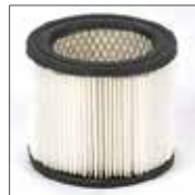
90398 (TYPE AA) Small Cartridge Filter Fits 1-4 U.S. gallon vacs, 5 U.S. gallon portable model H87S, 5 U.S. gallon HangUp®/ Wall Mount vacs and 6 U.S. gallon long life model P12S. Does not fit 1x1", Micro®, HangOn® and HangUp® Mini.