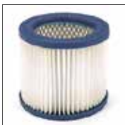
90341 (TYPE II) Small CleanStream® HEPA Cartridge Filter 99.97% efficient down to 0.3 microns. Non-stick surface makes for easy clean up and resists clogging. Fits 1-4 U.S. gallon vacs 5 U.S. gallon portable model H87S, 5 U.S. gallon HangUp®/ Wall Mount vacs and 6 U.S. gallon long life model P12S. Does not fit 1x1" Micro®, HangOn® and HangUp® Mini.