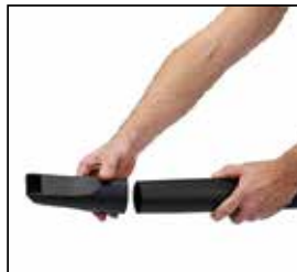
ATTACH BLOWER NOZZLE