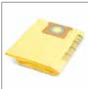
90671 (TYPE H) High Efficiency Filter Bags (2 pack) Fits 5-8 U.S. Gallon vacs.