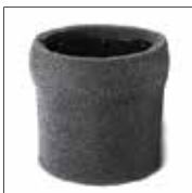
90585 (TYPE R) Large Foam Sleeve Fits Shop-Vac® brand wet/dry vacs 5 U.S. gallon and above, except 5 U.S. gallon portable model H87S, 6 U.S. gallon long life model P12S and HangUp® Wall Mount vacs.