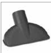
90675 - 8" Utility Nozzle Great for bulk dry pick up.