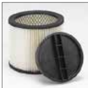
90304 (TYPE U) Large Cartridge Filter Fits Shop-Vac® brand wet/dry vacs 5 U.S. gallon and above except 5 U.S. gallon portable model H87S, 6 U.S. gallon long life model P12S and HangUp® Wall Mount vacs.