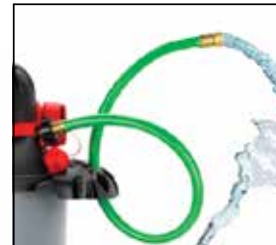
PUMP IT OUT