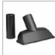
91967 - 6" Nozzle Ideal for cleaning vehicle interiors, workshop benches and more.