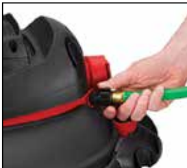
HOOK IT UP