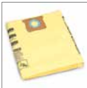
90672 (TYPE I) High Efficiency Filter Bags (2 pack) Fits 10-14 U.S. Gallon vacs.