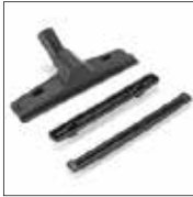
90665 - Deluxe Floor Nozzle with Squeegee Insert and Brush Insert A swivel elbow and the extra wide cleaning path makes clean up a snap.