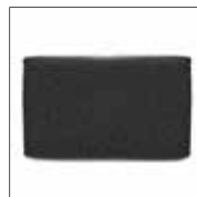
90525 (TYPE MM) Micro Foam Sleeve Fits 1 U.S. gallon Micro® vac.