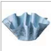
90137/90107 (TYPE T/S) Reusable Dry Filters 90137 - without mounting ring 90107 - with mounting ring