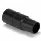
90627 - 1 1/2" to 1/4" Adapter Allows you to use 1/4" accessories with a 1 1/2" hose.