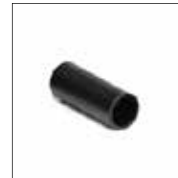
91959 - 1/4" to 1 1/2" Adapter Allows you to use 1/4" hose with a 1 1/2" accessories.