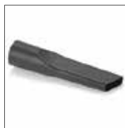
90678 - Crevice Tool Gets hard-to-reach places. Cleans radiators, vehicle interiors, etc.