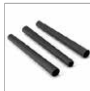
90614 - 3-Piece Extension Wands Provides longer reach when cleaning.