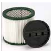
90307 (TYPE JJ) Large CleanStream® High Efficiency Cartridge Filter 95% efficient down to 0.3 microns. Non-stick surface makes for easy clean up and resists clogging. Fits Shop-Vac® brand wet/dry vacs 5 U.S. gallon and above, except 5 U.S. gallon portable model H87S, 6 U.S. gallon long life model P12S and HangUp®/ Wall Mount vacs.