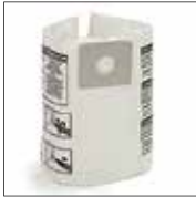
90661 (TYPE E) Filter Bags (3 pack) Fits 5-8 U.S. Gallon vacs.