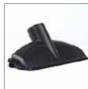
90677 - 14" Floor Nozzle Cleans wide areas with bulk dry pick up and wet pick up power.