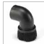
90679 - Right Angle Brush Use on blinds and all irregular surfaces.