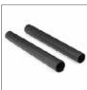
90684 - 40" Extension Wand (2 piece) Provides longer reach when cleaning.