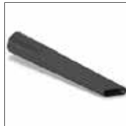
91996 - Crevice Tool Gets hard-to-reach places. Cleans radiators, vehicle interiors, etc.