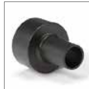
90685 - 2 1/2" to 1/4" Conversion Unit Allows you to use 1/4" accessories with a 2 1/2" hose.