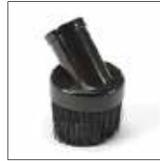
90615 - Round Brush Great for all purpose dry pick up...dirt, sawdust, furniture blinds, etc.