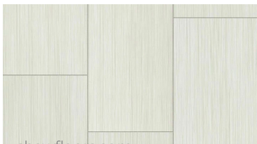
shawfloors.com 100 Gossamer