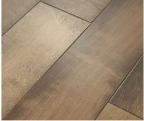
1012 Independence Ha