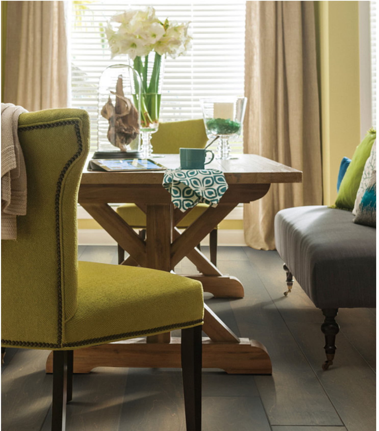
7019 Freedom Trail shawfloors.com