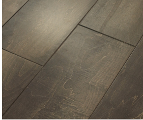
5023 Mount Rushmore