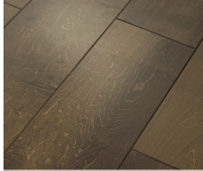
7019 Freedom Trail