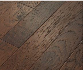
941 Three Rivers