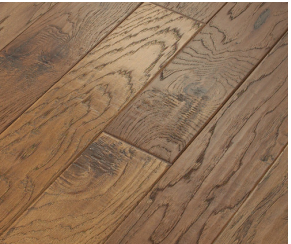
2000 Pacific Crest