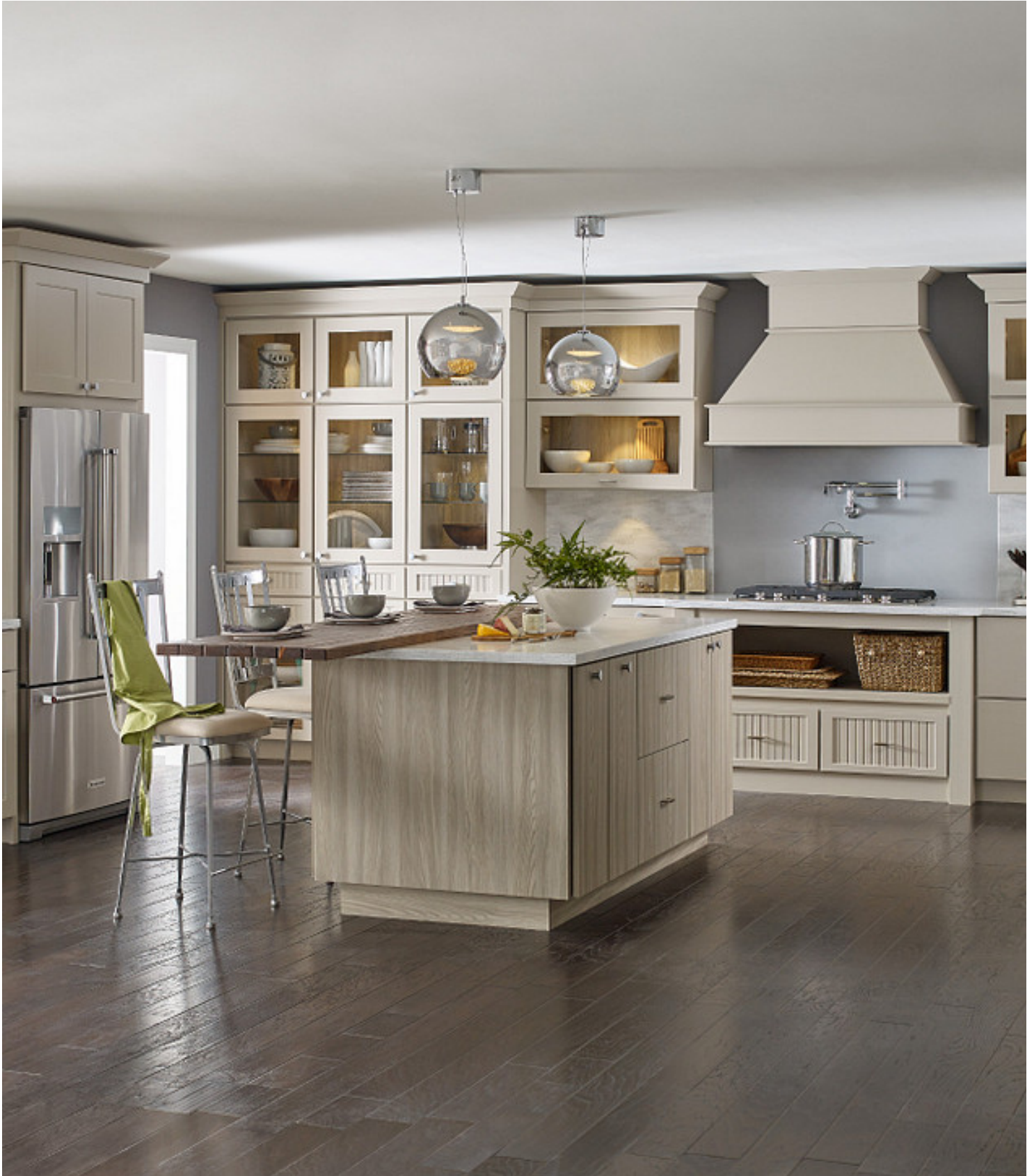
9000 Bearpaw shawfloors.com