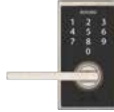
Schlage Touch™ Camelot & Century trim Deadbolt & lever options