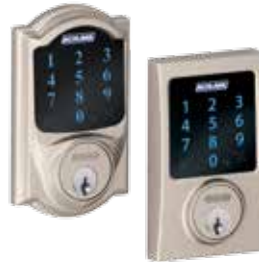
Schlage Connect™ (BE469)