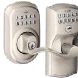
Keypad locks (BE365 & FE595)