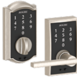
Schlage Touch ™ (BE375 & FE695)