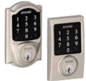
Schlage Connect™ (BE468)