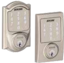
Schlage Sense™ (BE479)