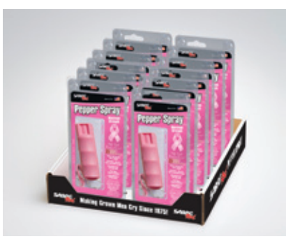
BX-HC-NBCF-02 – Compact counter display holding 12 HC-NBCF-02 units. 9 \frac{1}{2} " x 10" x 8"