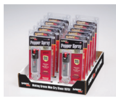
BX-KR-14-US-02 – Compact counter display holding 12 KR-14-US-02 units. 9 \frac{1}{2} "x 10" x 8"