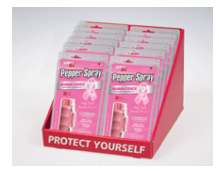
BX-HC-NBCF-01 – Eye catching red, counter display holding 12 HC-NBCF-01 units. 11 \frac{1}{2} " x 13 \frac{1}{4} " x 10"