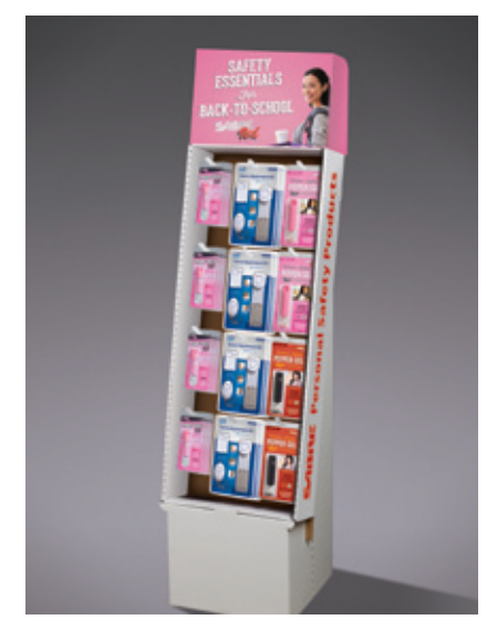
FD-BTS-01 – 48 piece back-to-school display includes: 16 KR-NBCF-02, 16 HS-DAK, 8 HC-14-BK-US, and 8 HC-NBCF-01. Also available, FD-BTS-02 featuring Campus Safety Pepper Gel. 17" x 16 <sup>3</sup>/<sub>4</sub>" x 69 <sup>1</sup>/<sub>4</sub>"