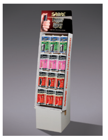
SFD-01 – SABRE Advanced 3-In-1 Floor Display SRUFD-01 – SABRE RED Floor Display 48 piece corrugated floor display includes: 12 Runners, 12 Pink Hard Case Units, 12 Black Hard Case Units, 12 Red Hard Case Units. 17" x 16 <sup>3</sup>/<sub>4</sub>" x 69 <sup>1</sup>/<sub>4</sub>"