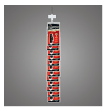
Clip Strip – 12 piece display with S-hook. See Price List for model numbers. 5'' \times 38 \frac{1}{4}''