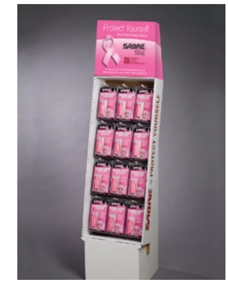
NBCF-FD-01 – 48 piece corrugated floor display featuring HC-NBCF-01 – the world's best selling pepper spray. 17'' \times 16\frac{3}{4}'' \times 69\frac{1}{4}''