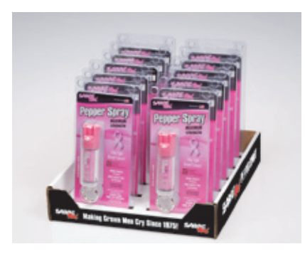
BX-KR-NBCF-02 – Compact counter display holding 12 KR-NBCF-02 units. 9\frac{1}{2} " x 10" x 8"

SABRE pepper spray is a tremendous impulse item. Maximize your SABRE sales by placing displays in high-traffic areas!