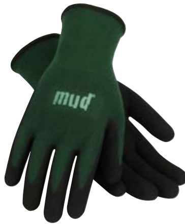
BAMBOO FLEX SM7197G