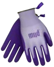
> P. 7 021 (MULTIPLE COLORS)