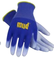
> P. 13 SM7236B