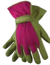
> P. 27 074 (MULTIPLE COLORS)