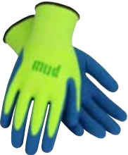
> P. 13 SM7187G