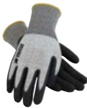
> P. 30 SW7266