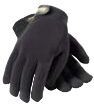
> P. 57 120-MX2805 (MULTIPLE COLORS)