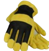
> P. 47 SW7217