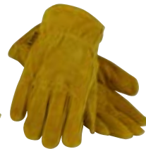
> P. 43 SW7220