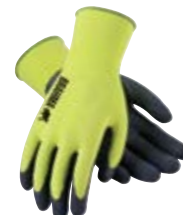
> P. 39 WA317