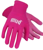
> P. 12 SM7185 (MIXED COLORS)