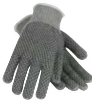
> P. 36 & 55 SW7177, SS7177