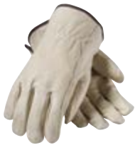
> P. 45 WA243