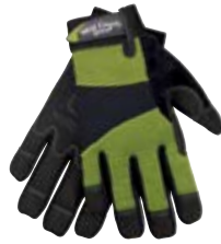
> P. 25 012/013 (MULTIPLE COLORS)