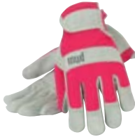
> P. 19 SM7200P