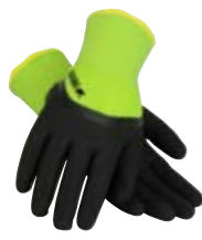
> P. 37 SW7193 (MULTIPLE COLORS)