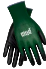
> P. 17 026 (MULTIPLE COLORS)