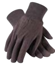
> P. 50 WA7532