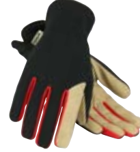
> P. 47 SW7233K