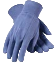
> P. 50 WA7536