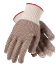
> P. 36 WA838