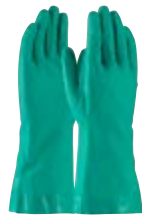
> P. 62 C5319