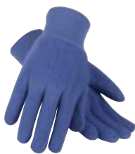
> P. 50 SW7213B