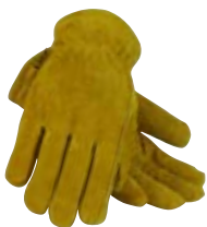
> P. 41 SW7224