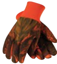
> P. 51 WA7542