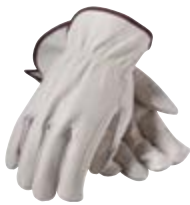
> P. 45 WA250