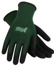
> P. 9 SM7197G