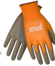
> P. 15 028 (MULTIPLE COLORS)