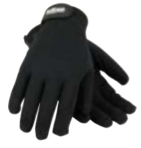
> P. 47 & 60 SW7248K, SS7248K