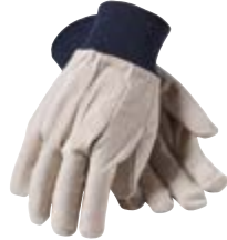
> P. 51 WA8124