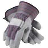
> P. 47 SW7206