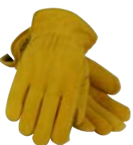
> P. 41 SW7225