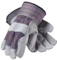
> P. 48 WA421