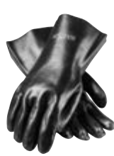
> P. 52 WA8753