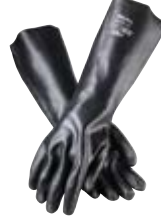
> P. 52 WA8783