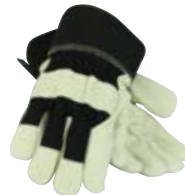
> P. 47 SW7203