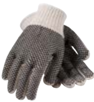
> P. 36 WA839