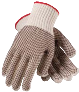
> WA8388A/L, WA8389A/XL