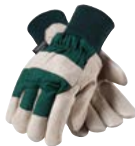
> P. 46 WA673