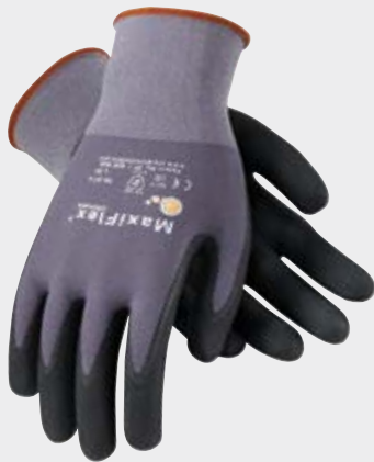
MAXIFLEX® ULTIMATE 34-874T