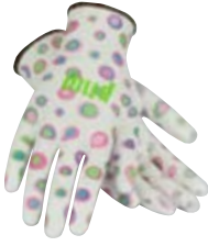
> P. 13 SM7184