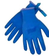
> P. 20 081 (MULTIPLE COLORS)