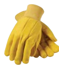
> P. 51 WA781