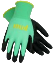
> P. 12 SM7241 (MULTIPLE COLORS)