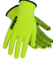
> P. 39 & 55 SW7176Y, SS7176Y