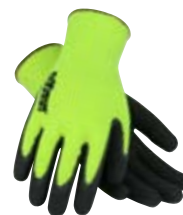
> P. 39 & 55 SW7178Y, SS7178Y