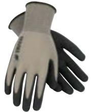
> P. 31 SW7191 (MULTIPLE COLORS)