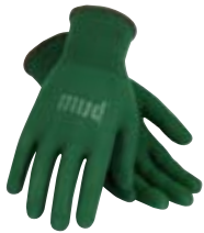
> P. 9 SM7194G