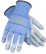
> P. 13 SM7188B