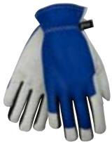
> P. 19 033 (MULTIPLE COLORS)