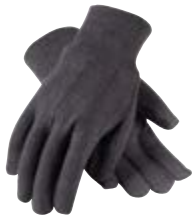
> P. 49 WA7530