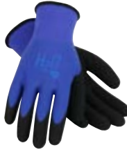
> P. 13 & 33 SM7186B, SW7186B