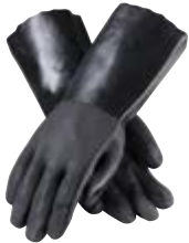
> P. 52 WA8707