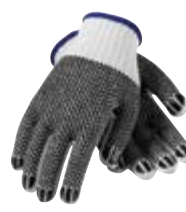
> P. 36 WA834