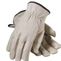
> P. 41 WA242