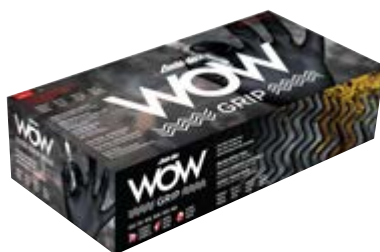
50 PACK AUTOMOTIVE > SWX00435