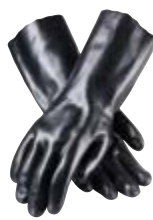
> P. 52 WA8773