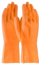
> P. 62 C5430