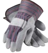
> P. 48 WA4204