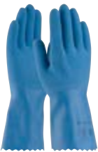
> P. 62 C6852L