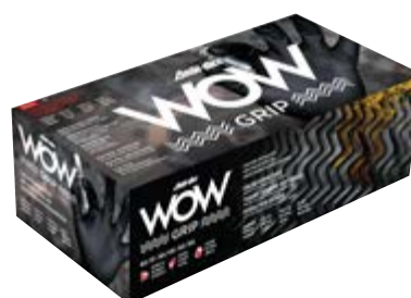
100 PACK AUTOMOTIVE > SWX00436