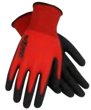
> P. 55 SS7191R