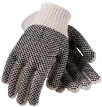
> WA8399A/S, WA8398A/L