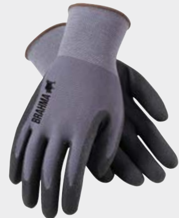
NITRILE MICROSURFACE GRIP WA9182A/M, WA9183A/L, WA9184A/XL, WA9185A/2XL