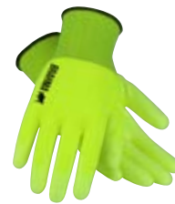
> P. 39 SW7189Y