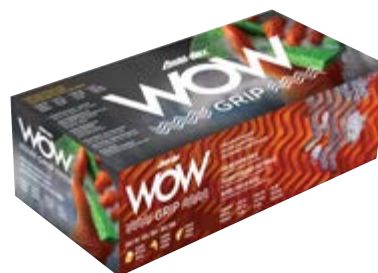
100 PACK HOUSEHOLD > SWX00439