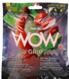
10 PACK HOUSEHOLD > SWX00437