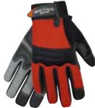
> P. 26 044/047 (MULTIPLE COLORS)