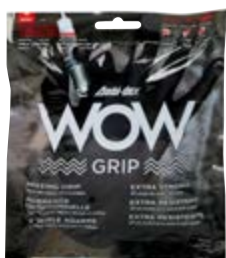
10 PACK AUTOMOTIVE > SWX00434