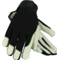
> P. 47 SW7202