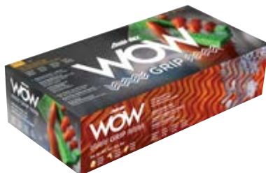
50 PACK HOUSEHOLD > SWX00438