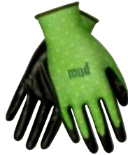
> P. 10 036 (MULTIPLE COLORS)