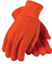
> P. 50 WA7547