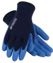
> P. 37 SW7181B