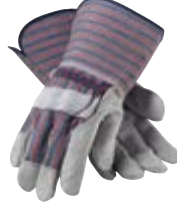
> P. 48 WA4234A