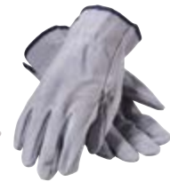
> P. 45 WA388