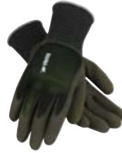
> P. 37 SW1430