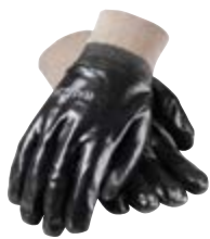
> P. 52 WA8723