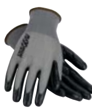
> P. 33 & 55 SS7247, SW7247