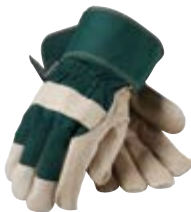
> P. 46 WA672