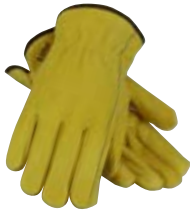
> P. 43 SW7219