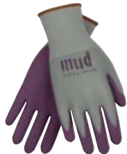
> P. 11 022 (MULTIPLE COLORS)