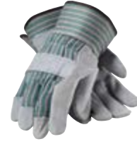
> P. 48 WA4403A