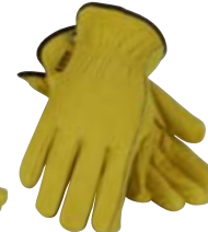
> P. 43 SW7222