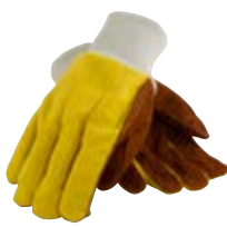
> P. 48 WA4004A