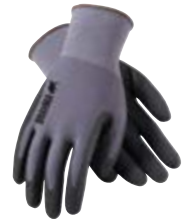
> P. 31 WA918