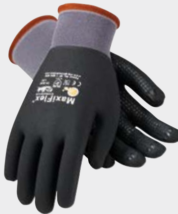
MAXIFLEX® ENDURANCE™ 34-846T