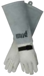
> P. 19 170/270