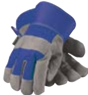
> P. 47 SW7201