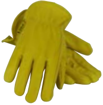
> P. 43 SW7218