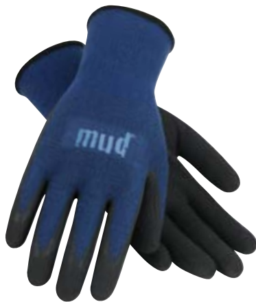
BAMBOO GRIP SM7196B