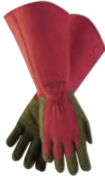
> P. 28 054