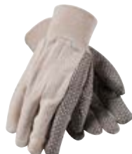
> P. 51 WA8353