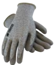
> P. 30 SW7265