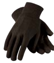
> P. 50 WA752