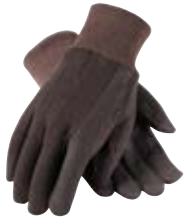
> P. 49 WA832