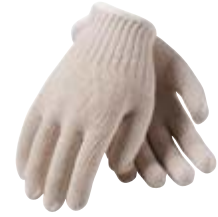
> P. 36 WA836, SW7198