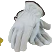
> P. 44 WA230