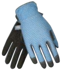
> P. 18 031 (MULTIPLE COLORS)