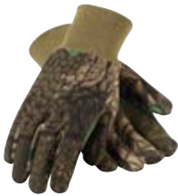
> P. 51 WA7555