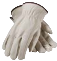
> P. 45 WA240