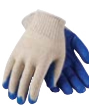
> P. 35 WA8308A