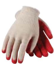
> P. 35 WA8306A