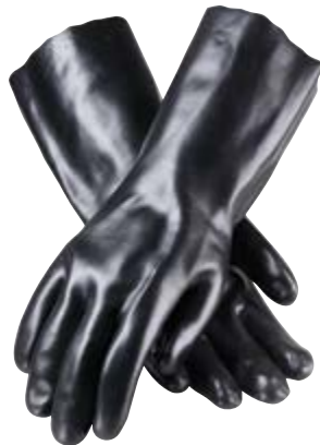
14" LENGTH > WA8773A/L