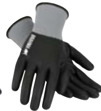
> P. 33 SW7192