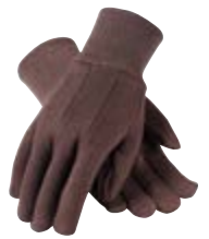
> P. 50 WA7533