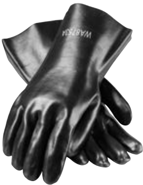
12" LENGTH > WA8753A/L