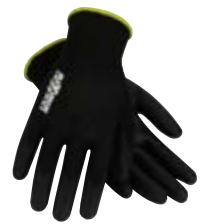
> P. 35 & 55 SW7190K, SS7190K