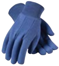
> P. 49 WA7534