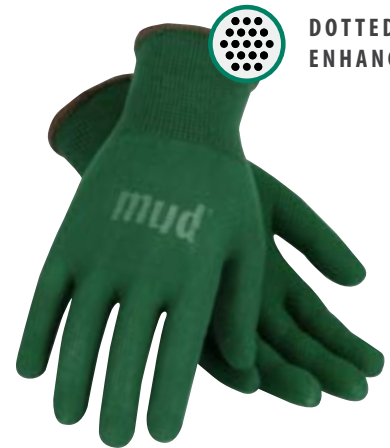
DOTTED FOR ENHANCED GRIP