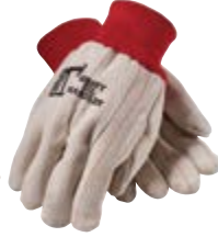
> P. 51 WA8164