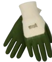
> P. 16 020 (MULTIPLE COLORS)