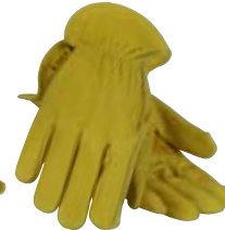
> P. 43 SW7221