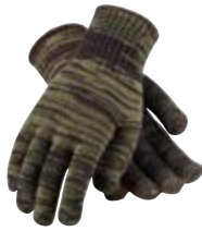
> P. 36 WA7562A