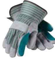
> P. 48 WA4225A