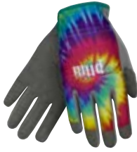
> P. 19 029TD