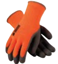
> P. 37 WA140