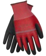
> P. 23 030 (MULTIPLE COLORS)