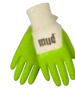
> P. 20 024G