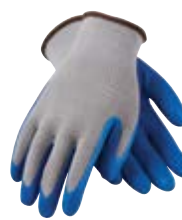
> P. 35 WA842