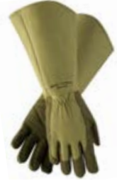
> P. 28 054