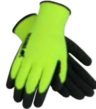
> P. 37 SW7227Y