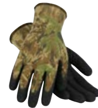
> P. 35 SW7228