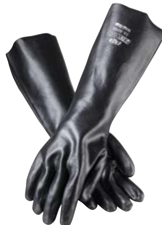
18" LENGTH > WA8783A/L