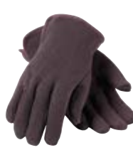
> P. 49 WA7644