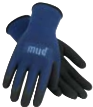
> P. 9 SM7196B