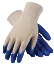
> P. 35 WA8301