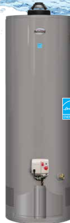
Powered Damper Ultra Low NOx 40 and 50-Gallon Capacities 38,000 BTU/h Natural Gas

Units meet or exceed ANSI requirements and have been tested according to D.O.E. procedures. Units meet or exceed the energy efficiency requirements of NAECA, ASHRAE standard 90, ICC Code and all state energy efficiency performance criteria.