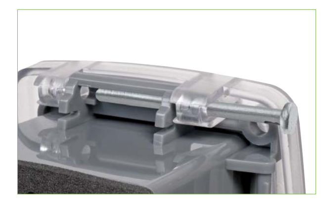
Unique stainless steel hinge pin design allows for vertical or horizontal mounting on the single gang cover.