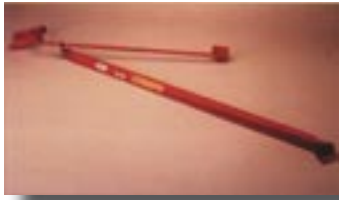
Model 2201 Triangular Pump Jack Brace