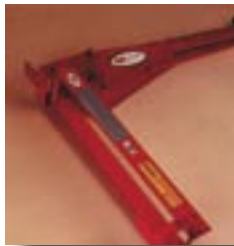
Model # 2204 Workbench/Guardrail Combo

1) Remove the round pin connecting the Nose Section of the Combo. 2) Remove the round pin from the bottom of the guardrail. 3) From the platform side of the pump jack, place the guardrail over the pump jack pole such that the Guardrail retainers are on the platform side of the poles and are pointed towards the sky. 4) Re-install the bottom pin connecting the guardrail to the pump jack using the holes provided in the connector plate at the top of the pump jack and the holes at the bottom of the guardrail. Ensure that the Guardrail rests on the outside of the connector plates. Secure in place by inserting a cotter pin into the hole at the end of the pin and bending it over. 5) Place the second pin through the holes provided at the top of the guardrail installing the nose section, so that the guardrail/workbench combo will ride up and down with the pump jack and secure with a cotter pin. Ensure that the nose section rests on the inside of the guardrail. 6) Place a single length 2x4 across the scaffold connecting two pump jacks at both the middle and the top of the guardrail in the