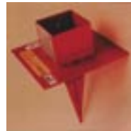
Model 2210 Pole Anchor

space provided and secure with #6d common nails. Install a toe board as required onto the scaffold plank. CAUTION: Always install guardrails when using pump jack scaffolding. The workbench should be fully decked when in use and should be used only as a work surface for tools and materials. Never stand on workbench. Spacing between poles should not exceed 7 feet on center when using 2 inch thick nominal walk planks, 9 feet on center when using 2 inch undresses lumber, or 11 feet on center when using aluminum walk planks. Poles must not exceed 30 ft. in height and must be secured using rigid triangular steel bracing at the top, bottom and at 10-foot intervals. Mending plates must be installed at all splices. Care & Maintenance: Inspect all pump jack equipment including the pump jack pole before and after each use to be sure that there is no damage, deformation or deterioration due to rusting or extensive use to any of the equipment's components. Read and follow the instructions and warnings on the Qual-Craft Pump Jack before installation and use of this product.