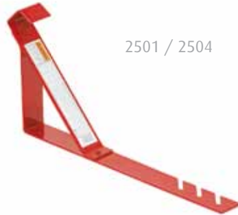
2501 / 2504

3501/3504/3507 – for use on 12/12 Fixed Pitch Roofs