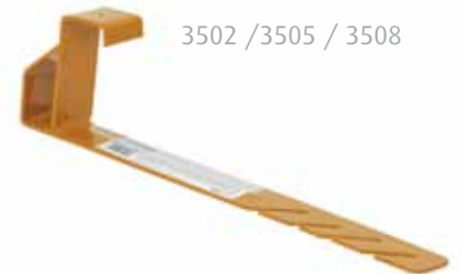
3502 / 3505 / 3508