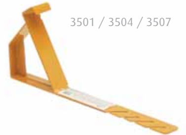
3501 / 3504 / 3507