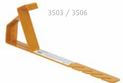
3503 / 3506