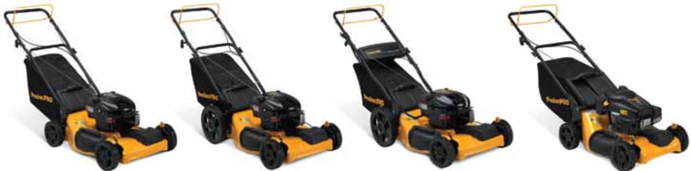
Poulan Pro PR625Y22RP 961420073 Walk Behind Mower