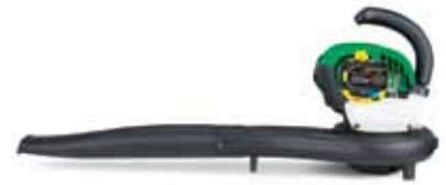
Weed Eater WEB160 952711845 Blower