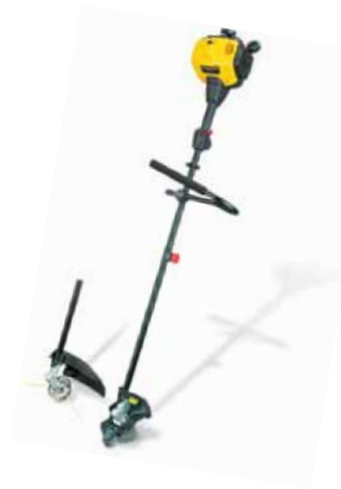
Poulan Pro PP333 952711951 Straight Shaft Trimmer/Brushcutter