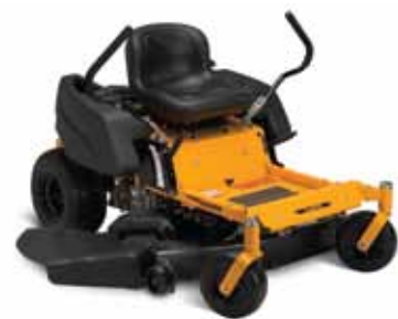
Poulan Pro 380ZX 966550101 Zero Turn Mower