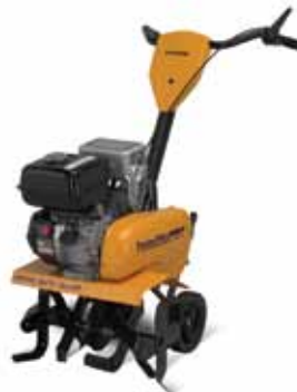
Poulan Pro FT900 960820016 Tiller