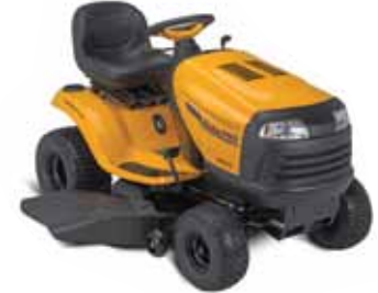
Poulan Pro PB195H42LT 960420107 Lawn Tractor