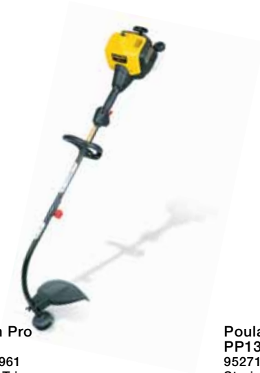
Poulan Pro PP033 952711961 Curved Trimmer