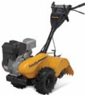
Poulan Pro RT900 960920021 Tiller