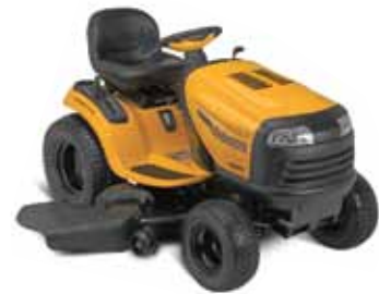
Poulan Pro PB23H48YT 960420109 Yard Tractor