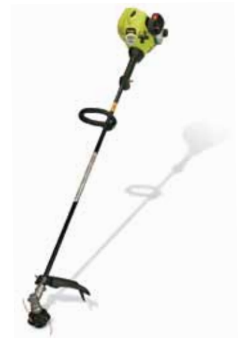
Poulan P2500 952711931 Trimmer