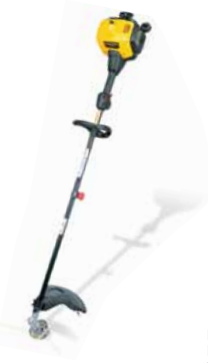
Poulan Pro PP133 952711962 Straight Shaft Trimmer