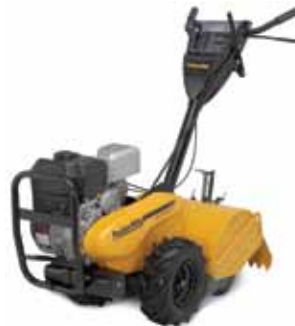
Poulan Pro PRRT900 960920022 Tiller