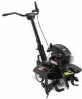
Poulan VF550 960820015 Tiller