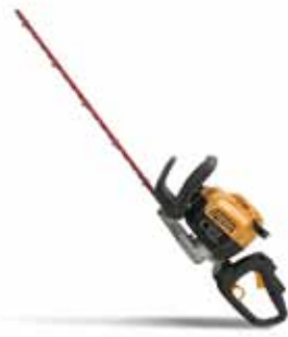
Weed Eater GHT195 952711802 Hedge Trimmer