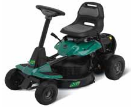
Weed Eater ONE 875/26 960220007