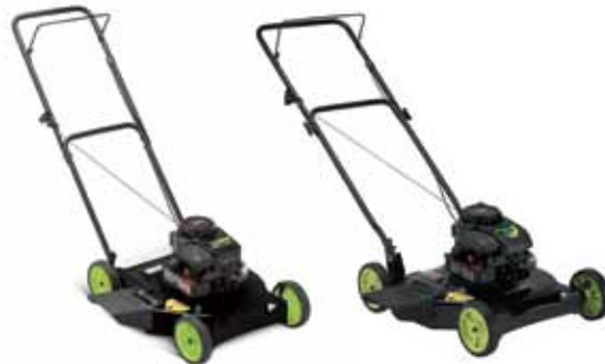
Poulan PO450N20S 961120070 Walk Behind Mower