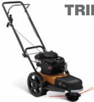
Poulan Pro PPWT62522 961 720006 Wheeled Trimmer