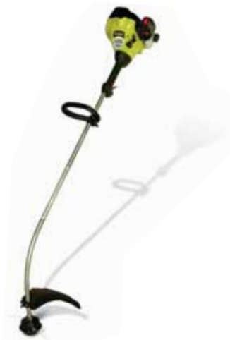
Poulan P1500 952711930 Trimmer