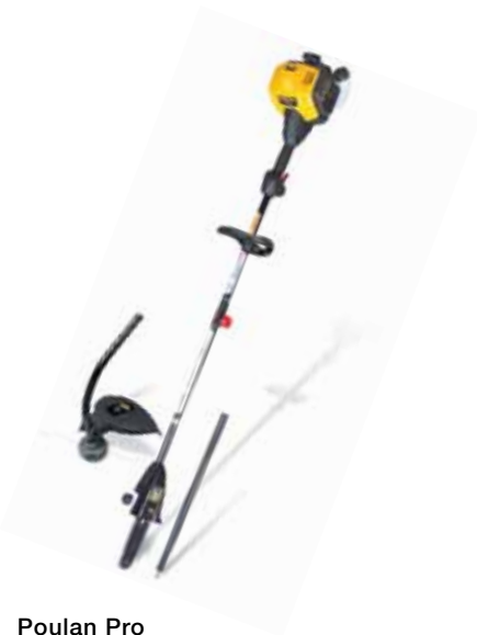
Poulan Pro PP338T 966423701 Pole Pruner/Trimmer Head Included