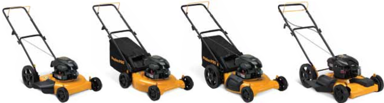
Poulan Pro PR550N22SH 961120083 Walk Behind Mower