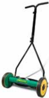
Weed Eater WE 16R 9615400-01 Reel Mower