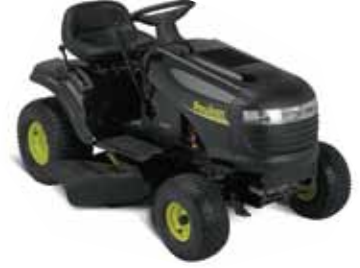
Poulan PO12530LT 960420105 Lawn Tractor