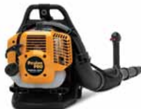
Poulan Pro BVM200VS 966454201 Blower/Vac