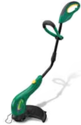
Weed Eater WE EL-11 966047801 Trimmer