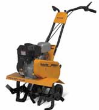
Poulan Pro HDF900 960820017 Tiller