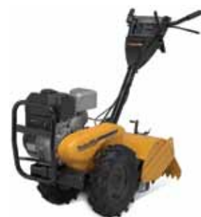
Poulan Pro DRT900 960920023 Tiller