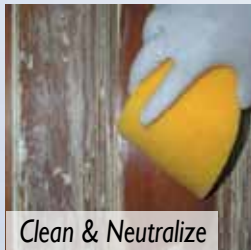
Clean & Neutralize