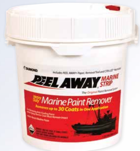
GAL-M101, 5 GAL-M105