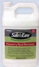
GAL-0997 5 GAL-0996

Safe n' Easy® Ultimate Stone & Masonry Cleaner is a biodegradable product. It will safely clean a variety of contaminants from natural and man-made stone and brick surfaces. ULTIMATE is non-toxic, it does not contain any bleach, abrasives, caustic, muriatic or hydrofluoric acids or petroleum distillates. This environmentally friendly formula is a ready-to-use gel product and is generally used accordingly. Available in Gallons and 5 Gallon Pails.