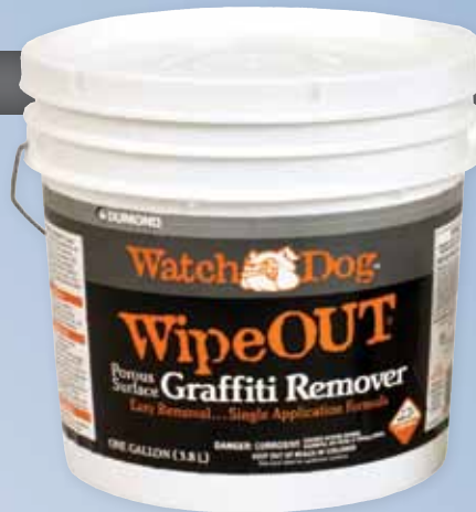
GAL-8401, 5 GAL-8405