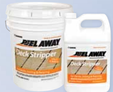
GAL-2150, 5 GAL-2155

Peel Away® Deck Stripper is a ready to use, biodegradable stripper for removing oil and water based stains, clear finishes, weathered latex and varnish from pine, oak, cedar, redwood and pressure treated decks, siding and fencing. Cedar and redwood may darken after stripping. After stripping, we strongly recommend using Peel Away® Deck Brightener & Neutralizer. Available in Gallons and 5 Gallon Pails.