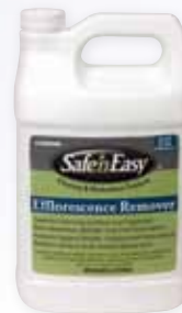
GAL-0910 5 GAL-0911

Safe n' Easy® non-toxic Efflorescence Remover is a newly developed product that replaces conventional mineral and organic acids for the removal of efflorescence. Safe n' Easy® Efflorescence Remover is a non-fuming, phosphate-free product that is a lot more effective than other acids when dissolving efflorescence salts and has none of the hazards that are inherent with commonly used acids. Safe n' Easy® Efflorescence Remover contains a special surfactant that provides detergency properties that will also help in the removal of oil/grease stains. Safe n' Easy® Efflorescence Remover does not contain any hydrofluoric acid, bleach, abrasives, caustic, mineral acids or petroleum distillates. It is formulated as a ready-to-use product. Available in Gallons and 5 Gallon Pails.