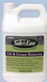
Spray-0907 GAL-0908 5 GAL-0909

Safe n' Easy® Oil and Grease Cleaner is a highly concentrated, biodegradable cleaning product and has specifically been formulated to clean motor oil, grease, and heavy soils from concrete and asphalt surfaces. This all-natural product can also be used to clean walkways, barbecue grills, lawn, and playground equipment, and a variety of other surfaces. As one of the best oil and grease removal systems on the market, Safe n' Easy® Oil and Grease Remover has been engineered to penetrate beneath the surface into porous concrete, asphalt and masonry surfaces. It does not sit on top of surfaces like other cleaners. Usual dwell time is three hours and it can then be either pressure washed or hosed off. No scrubbing is required. Available in Gallons and 5 Gallon Pails.