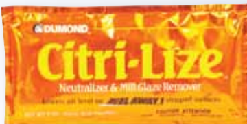
4 OZ-2031, 8 OZ-2030

Use this product with Peel Away® 1 after removal of paste and wash down. It can be applied by squeeze bottle or pressurized garden sprayer. It acts to reduce the pH of surface being stripped, thus ensuring good adhesion of a fresh coat of primer/paint.