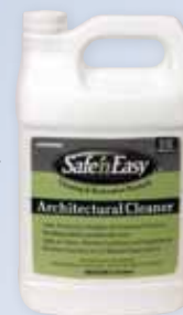
GAL-10901 5 GAL-0901

Safe n' Easy® Architectural Cleaner and Restorer is a heavy duty restoration cleaning product that can be used to clean and restore a wide variety of surfaces, such as brick and stone, safely and effectively. This all-natural product contains surfactants for emulsification and lowering surface tension, sequestering agents that help prevent redeposition of any emulsified or suspended contaminants, and optical brightening agent that makes whites whiter and colors brighter and other high powered ingredients. This biodegradable product requires no masking or collection of materials. Apply by spray or roller, wait 15 minutes and pressure wash. Available in Gallons and 5 Gallon Pails.