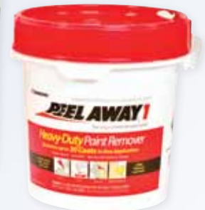
Available in 1.25 Gallon Kit and 5 Gallon Kit