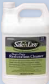
GAL-0998 5 GAL-0999

Safe n' Easy® Heavy Duty Restoration Cleaner is a biodegradable, slightly acidic, heavy duty masonry restorer and cleaner. For historic masonry restoration, it will remove a variety of contaminants from natural and man-made stone and brick surfaces. This product does not contain any bleach, abrasives, caustic, muriatic acid or petroleum distillates. As a masonry cleaner, it is concentrated for triple strength cleaning and formulated as a ready to use product. Apply by spray or roller, wait 15 minutes and pressure wash to a beautiful clean surface. Available in Gallons and 5 Gallon Pails.