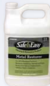
GAL-10902 5 GAL-0902

Safe n' Easy® Metal Restorer is a specially formulated environmentally friendly product for cleaning metal surfaces. A concentrated product, it quickly removes oxidation, hard water stains, rust, mineral deposits, grease and other contaminants from copper, brass, bronze, stainless steel, aluminum and glass surfaces. The addition of an inhibitor in Metal Restorer prevents rust and oxidation from quickly reforming. The inhibitor possesses unique chemical and physical properties, building both mechanical and electromechanical barriers against corrosive agents such as cleaning solutions and pollutants. Metal Restorer does not contain any bleach, abrasives, caustic, hydrofluoric or muriatic acid or petroleum distillates. Coverage: 150/200 sq. feet per gallon. Available in Gallons and 5 Gallon Pails.