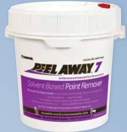
GAL-7001, 5 GAL-7005

User friendly — does not contain methylene chloride or caustic. Safely removes multi-layers of paint and varnish from decorative hardwoods without discoloration or raising the grain. Effectively removes most high performance and elastomeric coatings. Safe for use on any interior/exterior surfaces. Available in Gallons and 5 Gallon Pails.