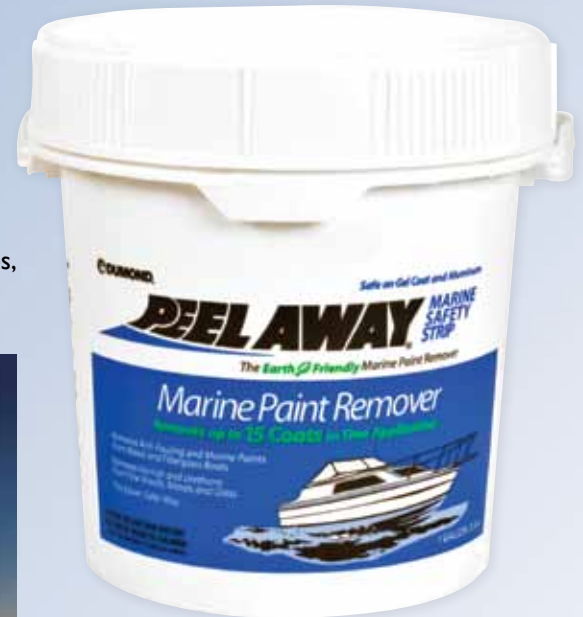
GAL-M001, 5 GAL-M005