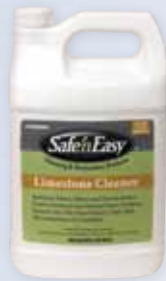
GAL-10900 5 GAL-0900

Safe n' Easy® Limestone Cleaner is a heavy-duty cleaner/restorer and can be used on a variety of stone surfaces safely and effectively. This product works best at cleaning limestone, marble and travertine, removing accumulated surface contaminants, mineral deposits and atmospheric stains. There is NO masking or collection of waste necessary. Apply by spray or roller, wait 15 minutes and pressure wash. Available in Gallons and 5 Gallon Pails.