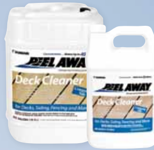
GAL-2180, 5 GAL-2185

Peel Away® Deck Cleaner is a concentrated and safe maintenance cleaner for exterior use on wood decking, siding, shakes and outdoor furniture. Peel Away® Deck Cleaner is also recommended for composite decking, concrete, stucco, vinyl siding, fiberglass and most outdoor furniture. Available in Gallons and 5 Gallon Pails.