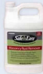
GAL-0904 5 GAL-0903

Safe n' Easy® Rust Remover is a slightly acidic, heavy duty cleaner and restorer. It will remove a variety of contaminants from natural and man-made stone surfaces. This eco-friendly, rust stain removal system does not contain any bleach, abrasives, caustic, muriatic acid or petroleum distillates. It is formulated as a ready-to-use product and is generally used accordingly; however, it can be diluted for slightly contaminated surfaces. Available in Gallons and 5 Gallon Pails.