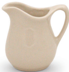
Fancy Pitcher #02818