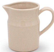
1 Quart Pitcher #02825