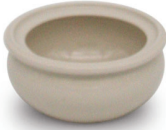
12 oz Soup Bowl #02795