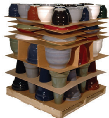
PP5 Garden Assortment #02412

* The colors in the birdbath and garden planter assortment, available in palletized pre-packs, are randomly chosen, providing you with a variety of our best selling colors.