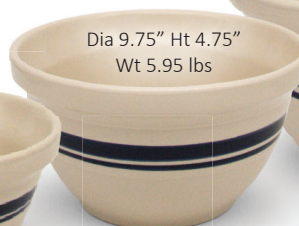
10" Mixing Bowl #12089