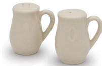
Salt & Pepper Shakers #02832