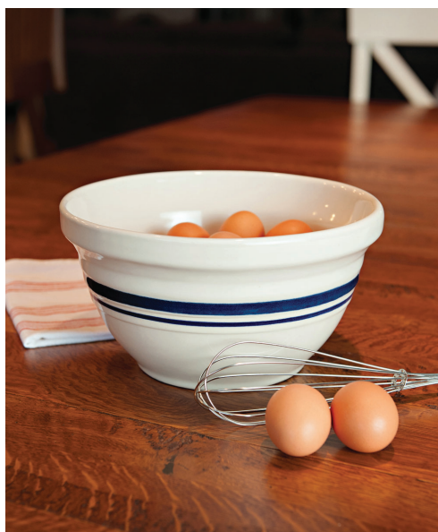
8" Mixing Bowl #12072