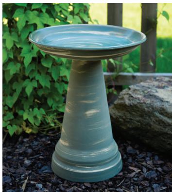
Heritage Green Birdbath Set #02009 (*Shown Left)