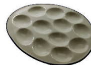
Egg Plate #12294