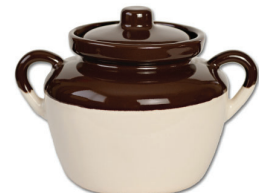
Bean Pot [2 Qt] #12058