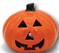
Large Round Pumpkin #12133