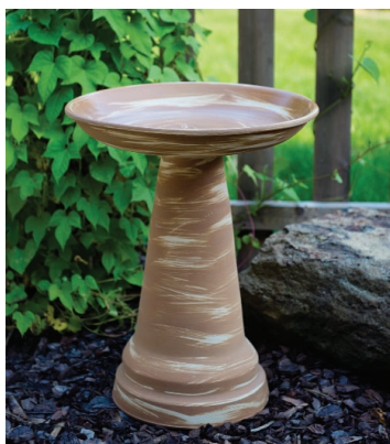
Heritage Brown Birdbath Set #02221 (*Shown Left)