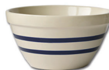
10" Shoulder Bowl #02658