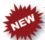
AuGratin Baker #12287