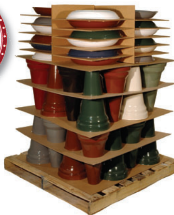
PP3 Birdbath Assortment #11587