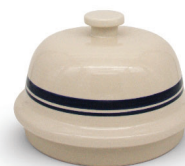
Bread Baker #12188

Top: Dia 11.625" Ht 7" Bottom: Dia 10.75" Ht 2" Total Wt 8 lbs