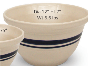
12" Mixing Bowl #12096