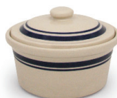
Covered Casserole #11907