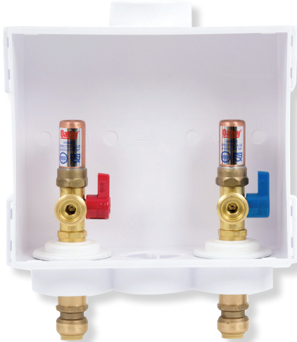
US Patent #6,155,286

The Quadtro offers one design for every installation