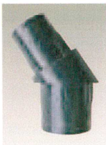
SRAR Stair Rail Adapter Connectors