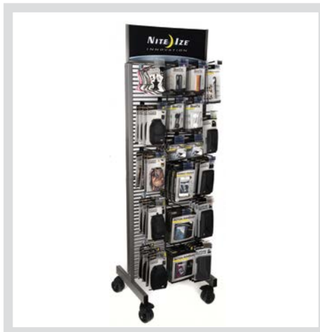
PERMANENT FLOOR DISPLAYS