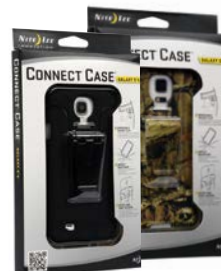
CNTG5-01-R8 + CNTG5-22-R8