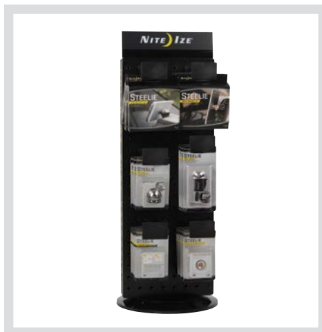
COUNTERTOP SPINNER DISPLAYS