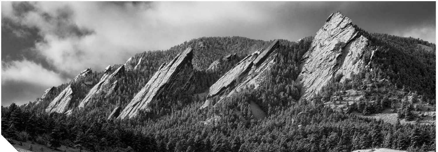
LOCATED IN BOULDER, COLORADO, USA