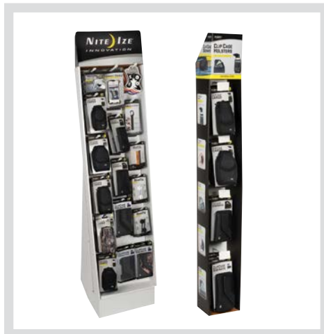
FLOOR & SIDE KICK DISPLAYS

Nite Ize features a variety of different display styles. We've included a few examples below, but please feel free to visit our website, or speak to your Nite Ize salesperson to see our full display assortment.