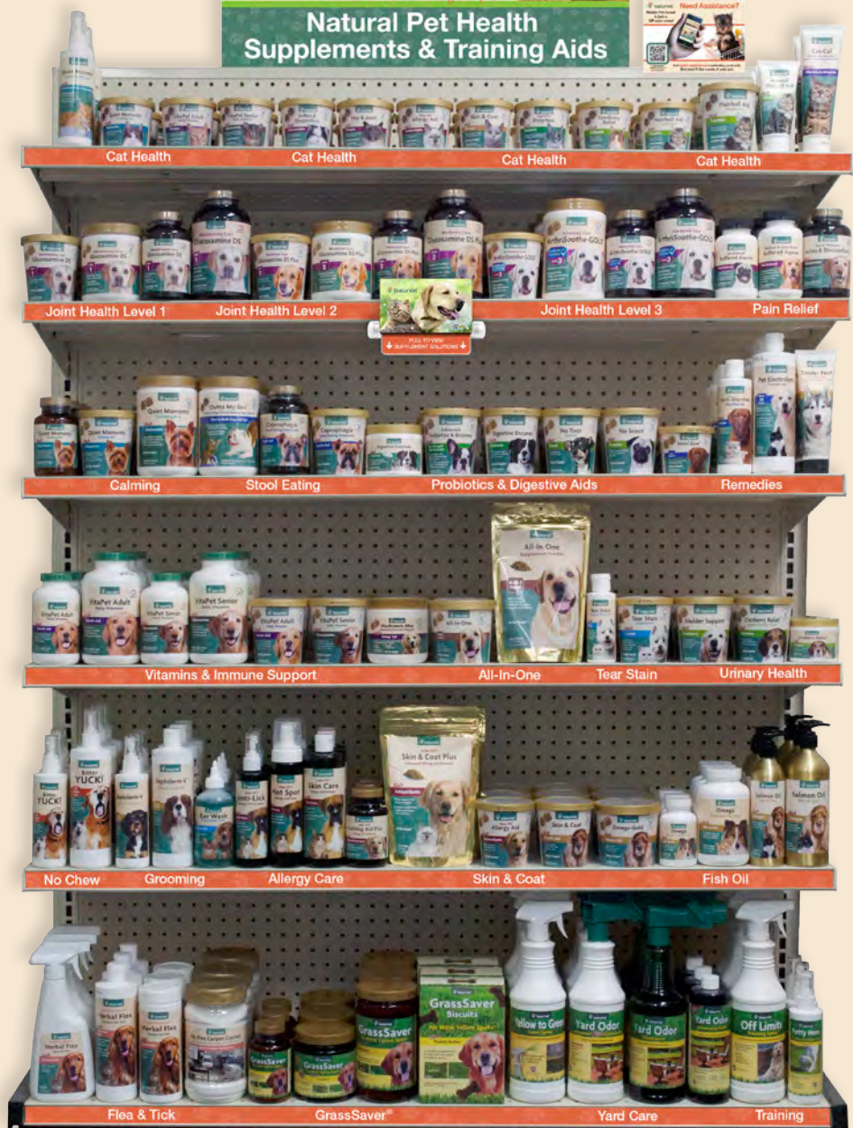
Dealer Rewards End Cap Option 1