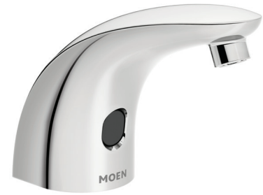
M•Power™ Transitional Style Electronic Soap Dispenser