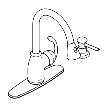
Terrace™ Single Handle High Arc Pulldown Kitchen Faucet