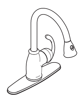
Terrace™ Single Handle High Arc Pulldown Kitchen Faucet