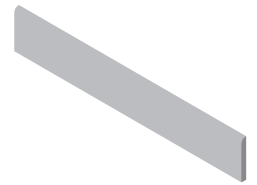
3" x 18" Bullnose