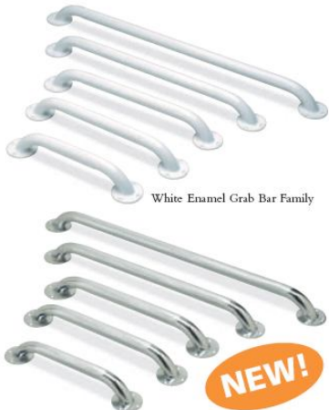
White Enamel Grab Bar Family