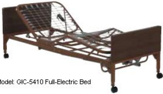
Model: GIC-5410 Full-Electric Bed