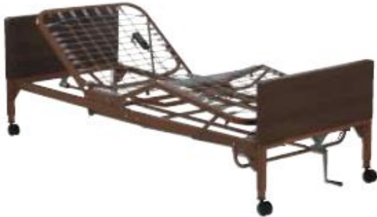
Models: GIC-5310 Semi-Electric Single Crank Hi/Lo Bed GIC-5210 Semi-Electric Two Crank Hi/Lo Bed