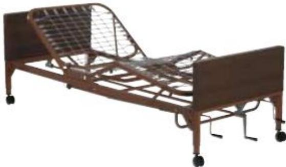
Models: GIC-5307 Manual Single Crank Hi/Lo Bed GIC-5207 Manual Two Crank Hi/Lo Bed

lifetime warranty on all welds two-year warranty on mechanical and electrical components.