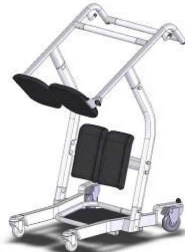
STA182 MANUAL STAND ASSIST THE STA182